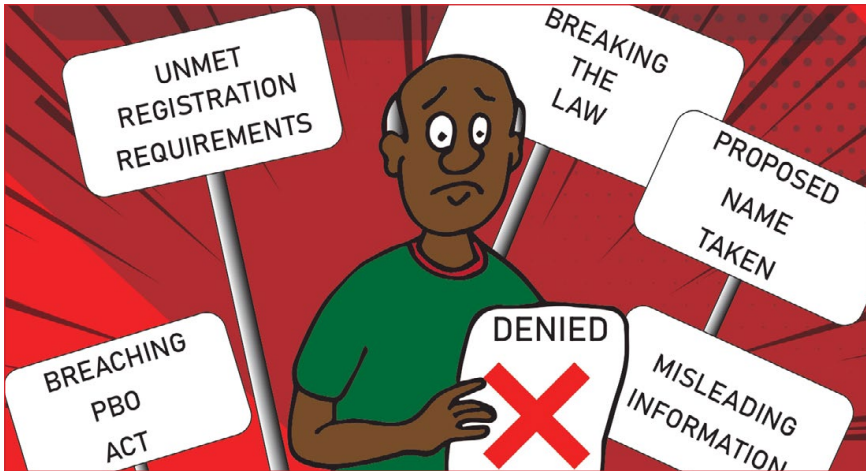
The Authority can refuse to register any organization as a PBO with reasons.

5. The Public Benefit Organizations Disputes Tribunal is set up by the PBO Act (Section 50(1)) as an independent mechanism of complaint and redress.