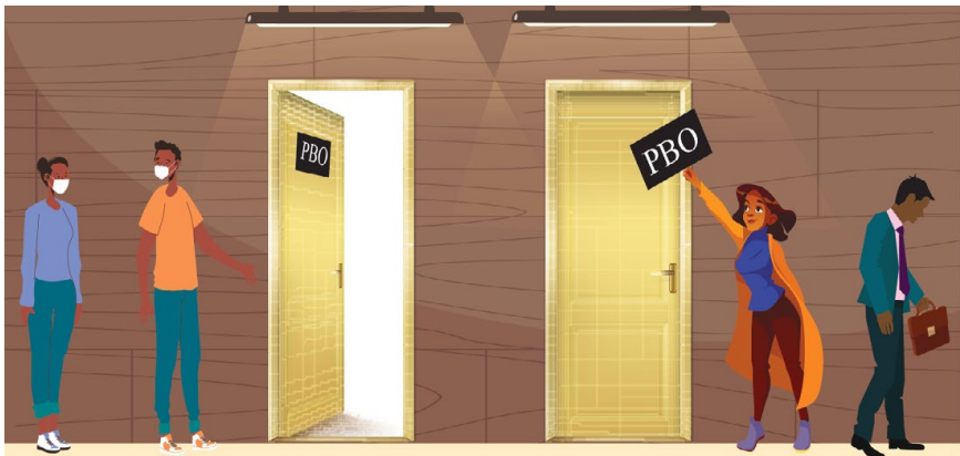
PBOs must abide by the requirements in the PBO Act in section 27.

The notice must include the reasons for the decision to wind-up or dissolve and the date when the organization is to cease to exist. The PBO must also give the Authority copies of all relevant documents confirming the winding up or dissolution, and a copy of the written report, financial statements and an auditor’s report for the period running from its previous financial year up to the date of the written notice (section 61 (1-3) ).