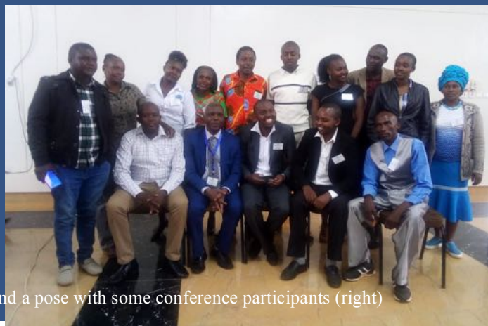
A standing ovation after the governor’s speech (left) and a pose with some conference participants (right)