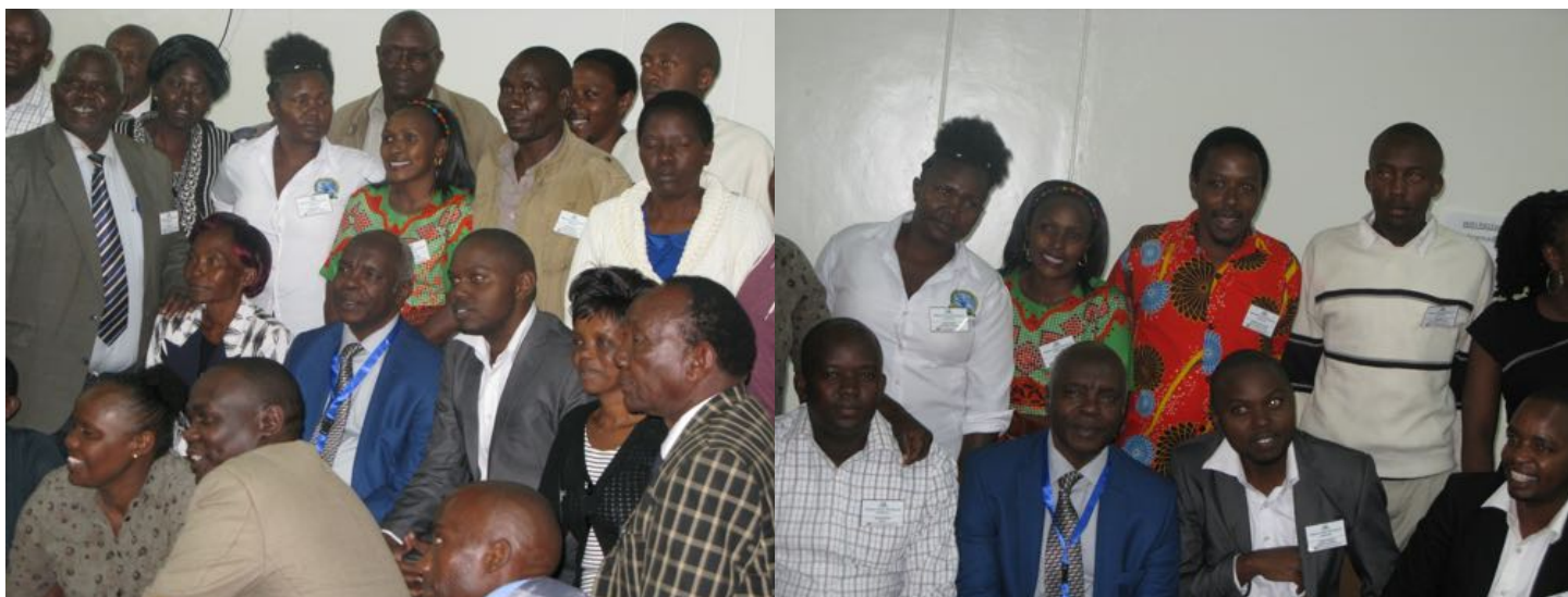
Two Minutes of fame: Conference participants posing for pictures with the governor

Civil society must however encourage partnership and collaboration to achieve some outreach goals that the state or County Government cannot achieve on its own. I welcome the role of CSOs to enable County Governments achieve their objectives.