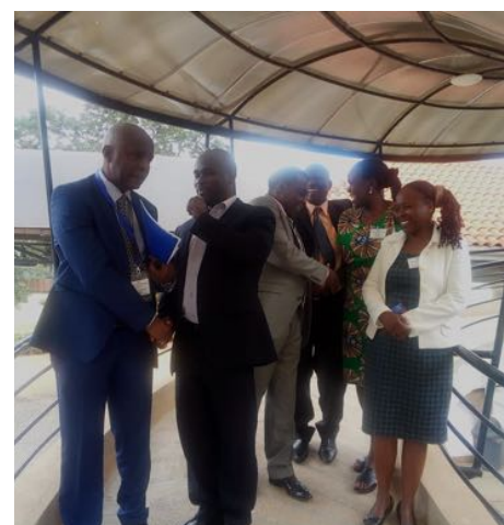
Welcoming the governor on disability friendly ramp at the hotel, that was highly commended