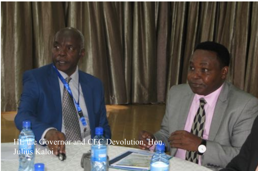
HE the Governor and CEC Devolution, Hon. Julius Kaloi