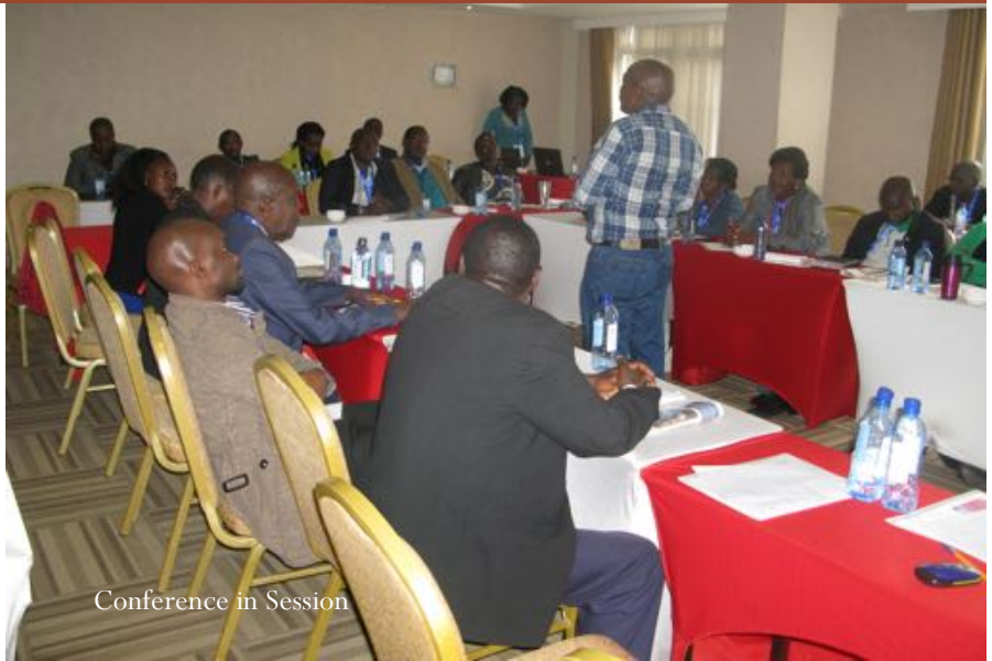
Conference in Session

effectiveness of Civil Society Organizations working together to bring effective changes within the sector itself and with the county.