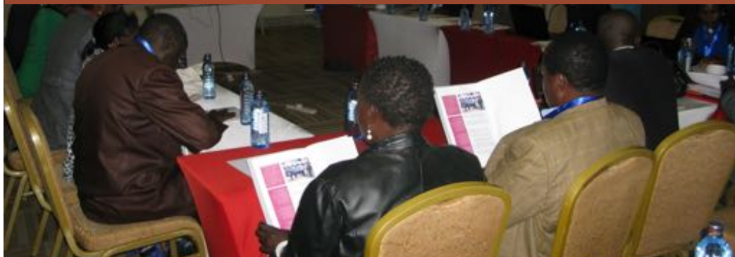
Leaders of CSO sector reviewing Progress in CSOs and county governments relationships and engagement in Machakos, July 2018