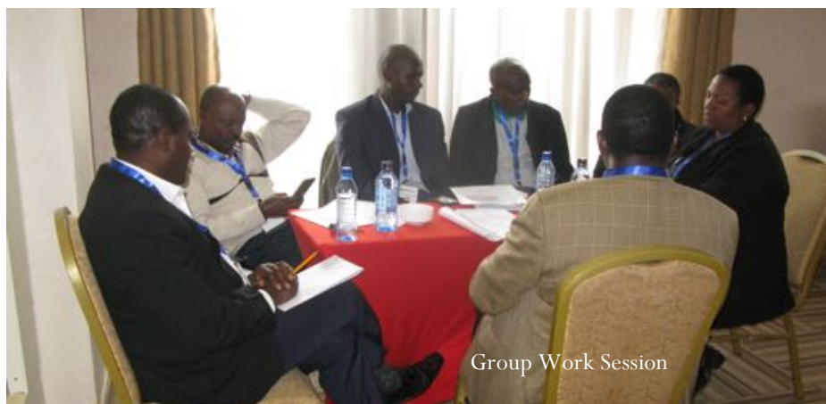
Group Work Session

consultation not a single item requested by CSOs was included in the budget.