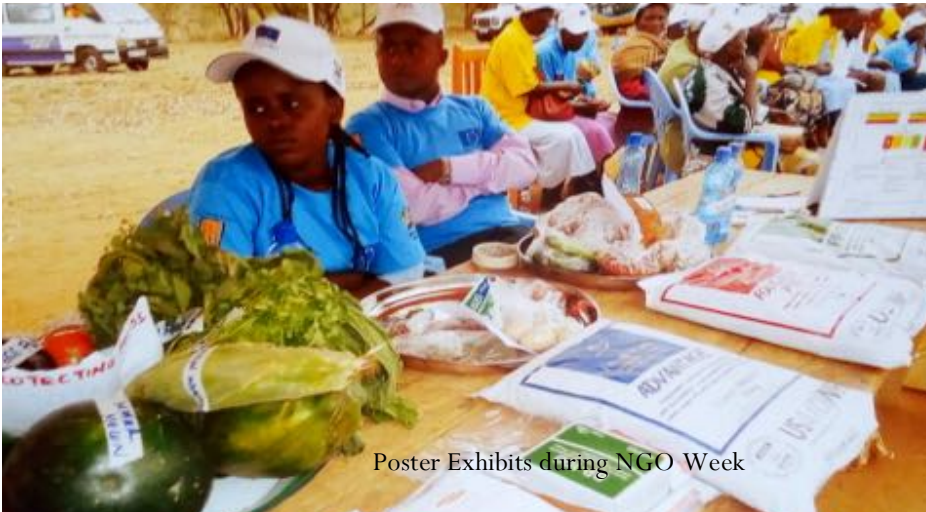
Poster Exhibits during NGO Week