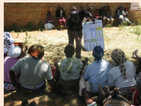
Sample Ballot Papers Shown at a Baraza